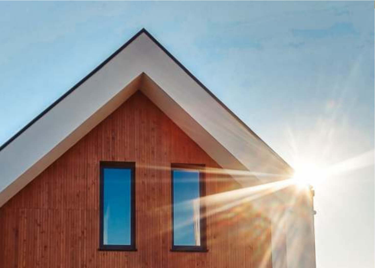
Architect's house, Eko-Archiplan. 2021