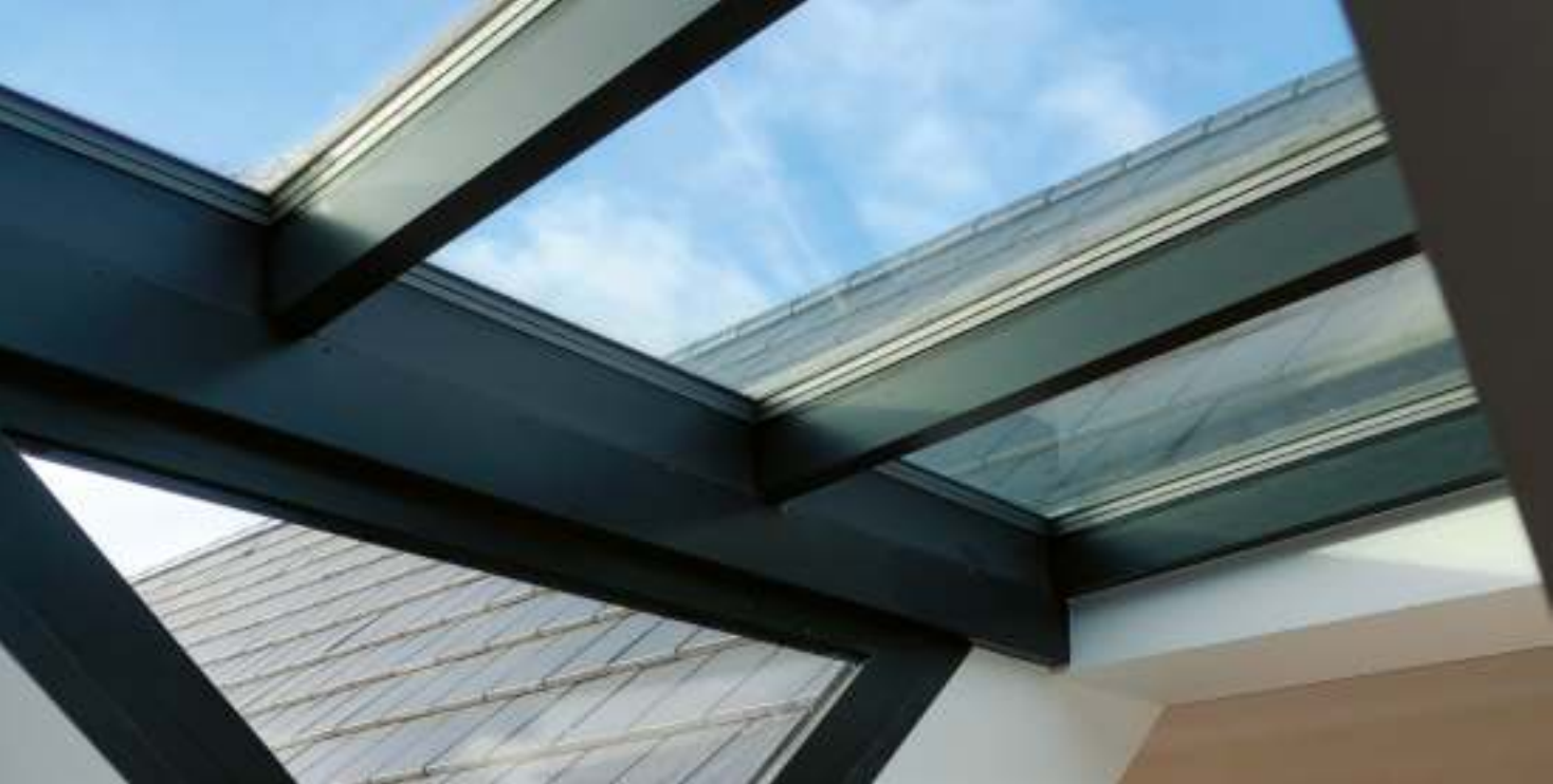
Architect's house, Eko-Archiplan. 2021