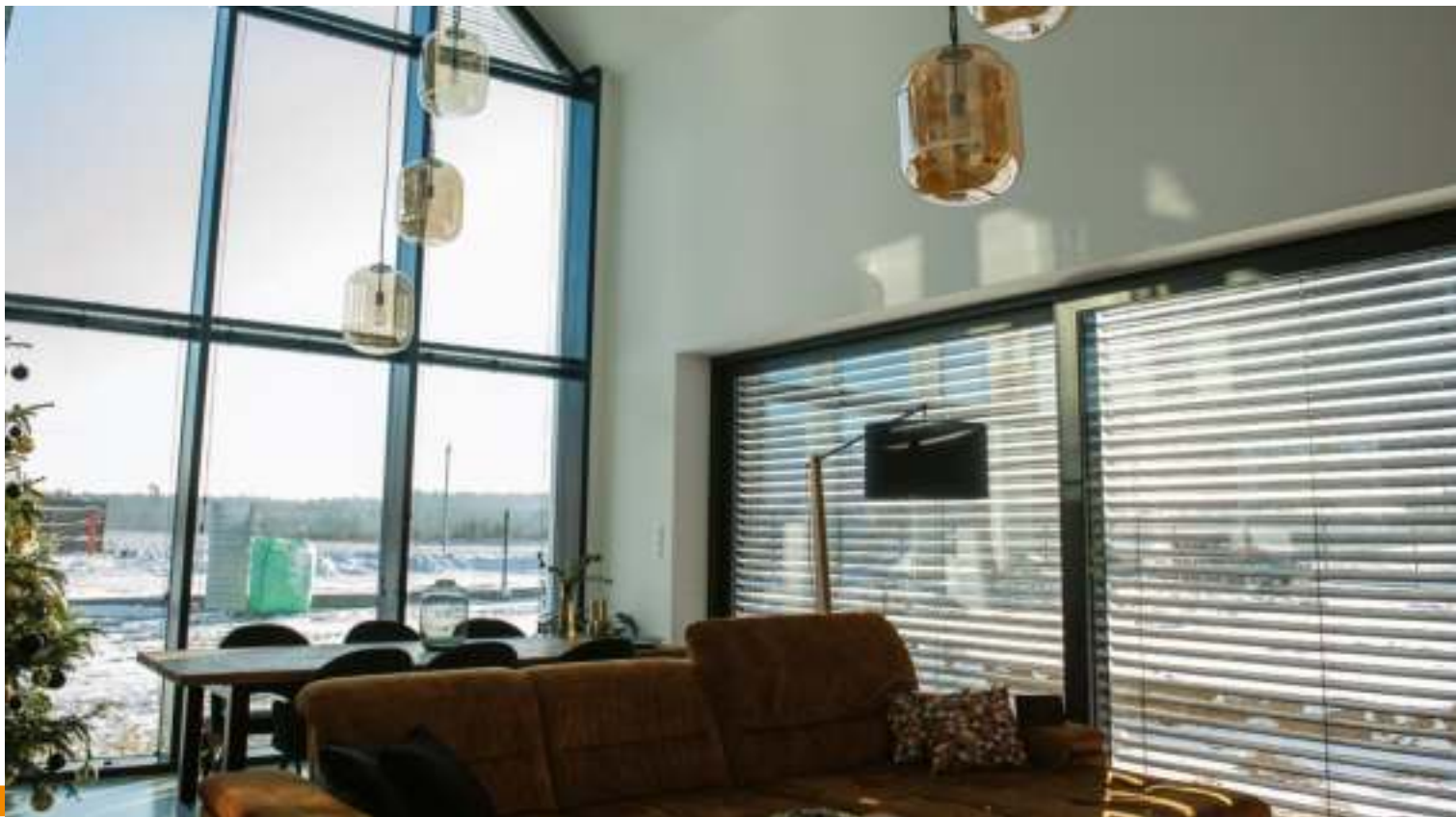
A modern barn , Ruś. 2020