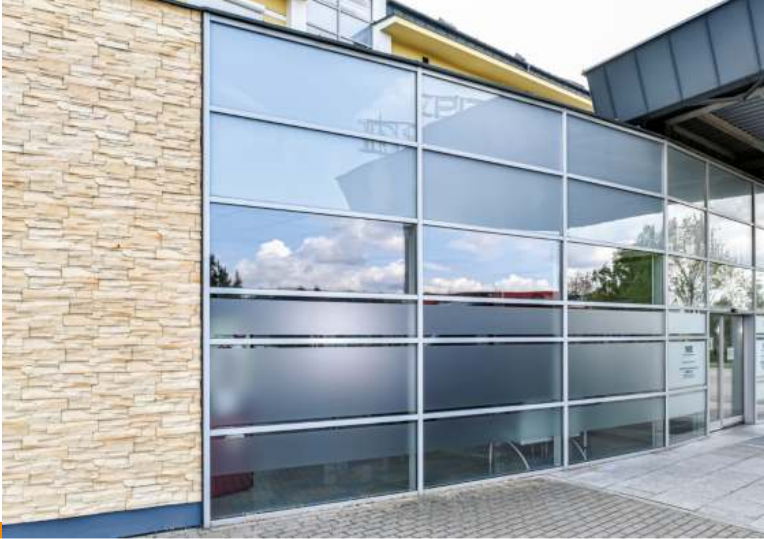
Supravis, Bydgoszcz. 2019