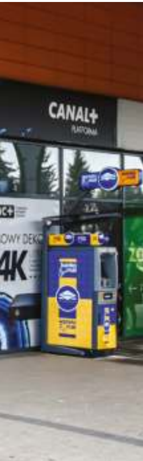
CH Dekada, Brodnica. 2014