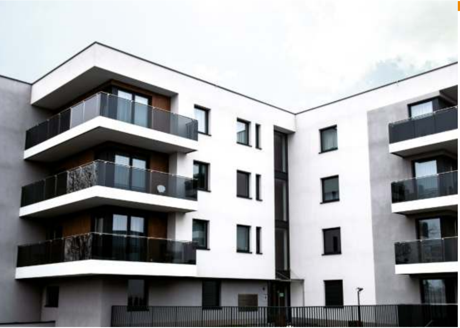
Residential buildings, Lubawa. 2019