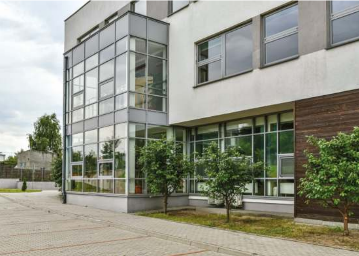
Vocational School Complex, Kurzętnik. 2019