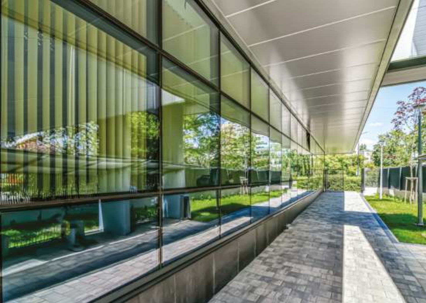
CML, Warsaw. 2019