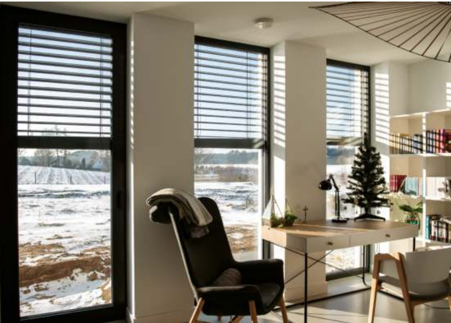
A modern barn , Ruś. 2020