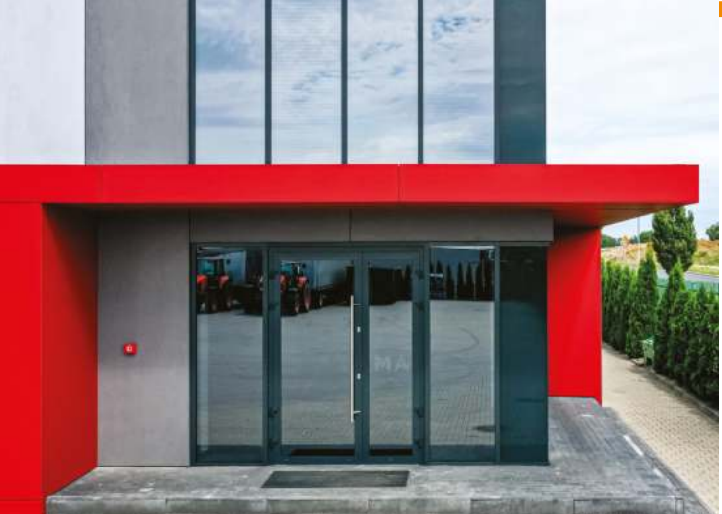
AMAK company headquarters, Lubawa. 2019