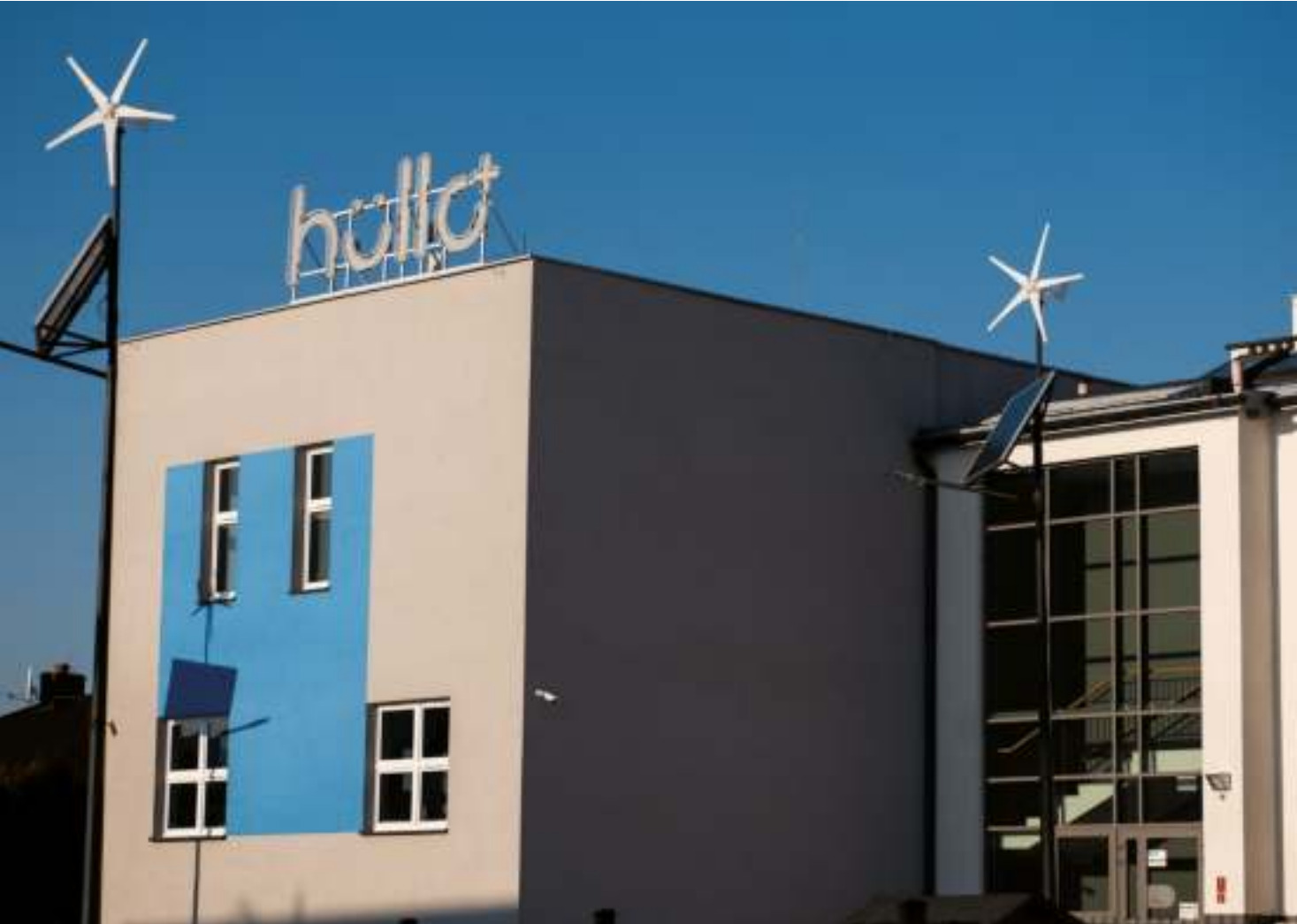
Hullo, Lubawa. 2020